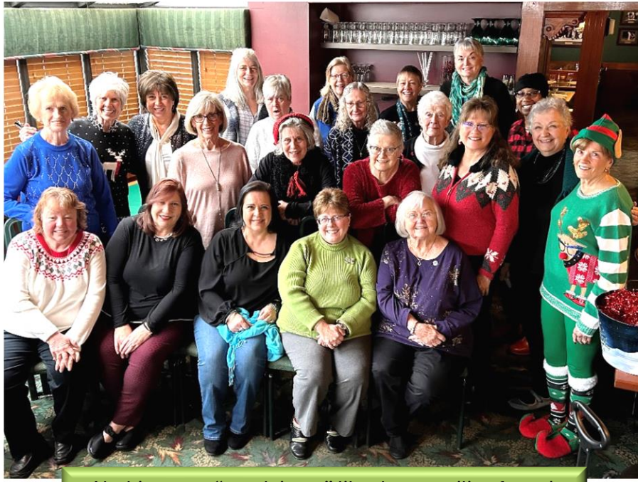
Nothing says "good times" like these smiling faces! Photo taken at the December 2 nd Holiday Luncheon at The Masters Restaurant.