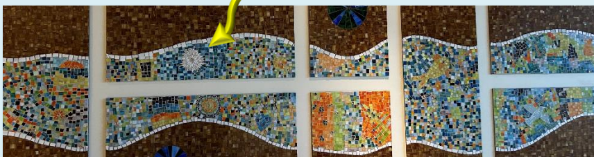
One to One's dahlia !